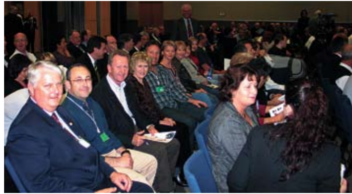
SA supporters at the finals