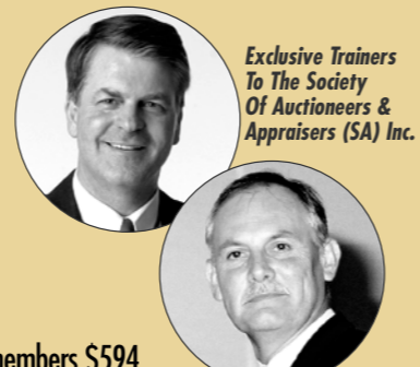
Exclusive Trainers To The Society Of Auctioneers & Appraisers (SA) Inc.

Limited to 6 participants only - please book early