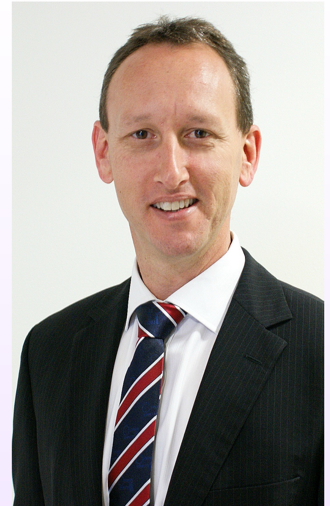
President, Marc du Plessis MSAA delegation from the Supreme Court of Beijing in China when they researched the way we conduct auctions here in Australia.

We have the best auction and documentation training with legislative updates, we are recognized internationally by hosting a