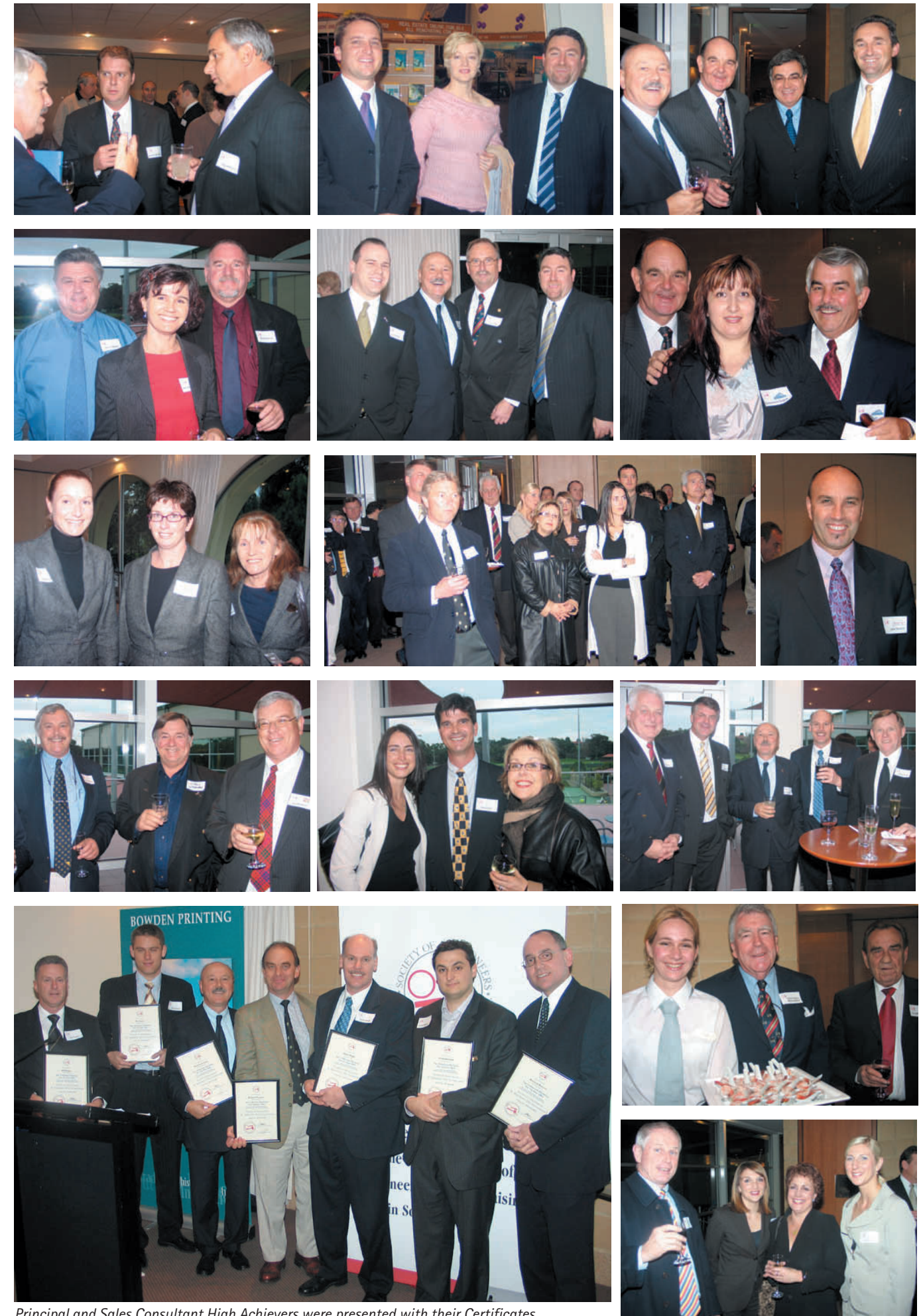
Principal and Sales Consultant High Achievers were presented with their Certificates.